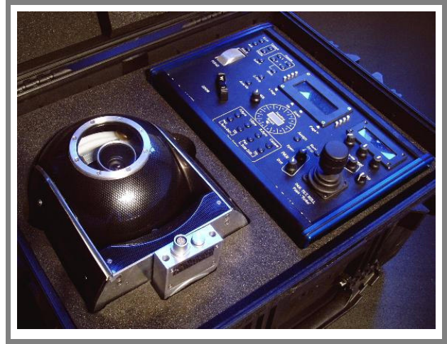
Supplied Flight Cased