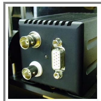
Camera back & connectors