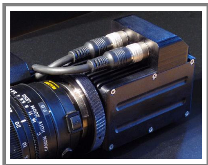
Camera with lens fitted.